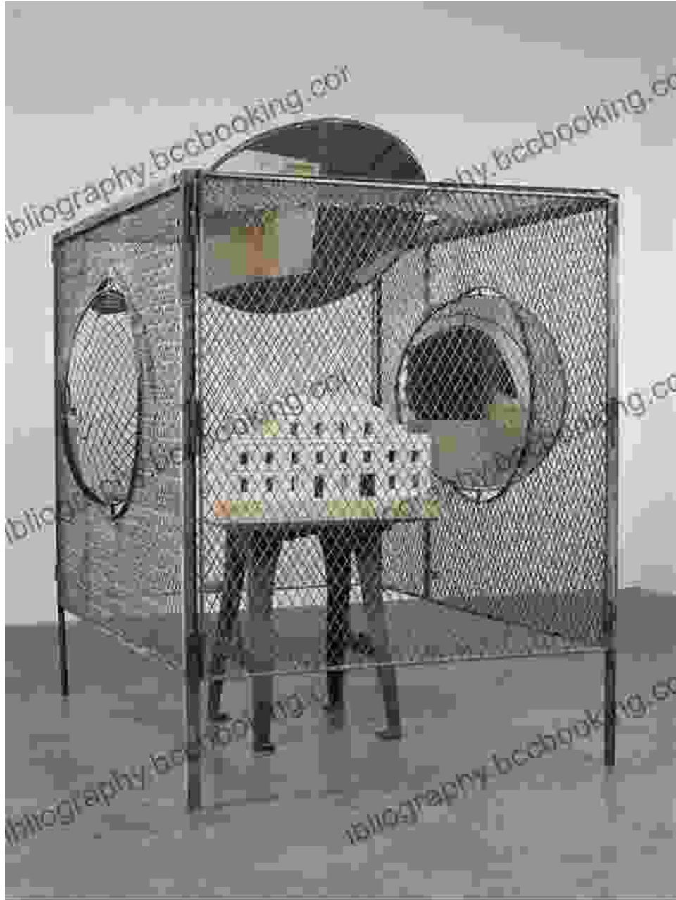
Louise Bourgeois, 'The Cells', 1991-1993. Fabric, steel, wood, and glass.